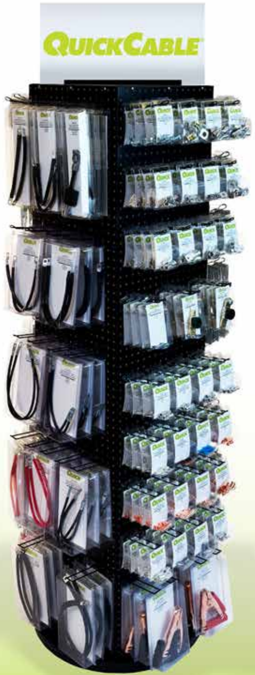
Panels C & D

Feature a wide array of our Quick® & Fusion® battery terminals & connectors in gauges 2 - 2/0 in both polarities, SB® housings and contact crimp kits ranging 50 - 350 amps, tools, terminal brushes, hydrometers, circuit breakers, braided strap, golf cart cables and Quicklinks® battery cables.