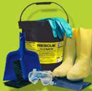
SAFETY & CHEMICALS