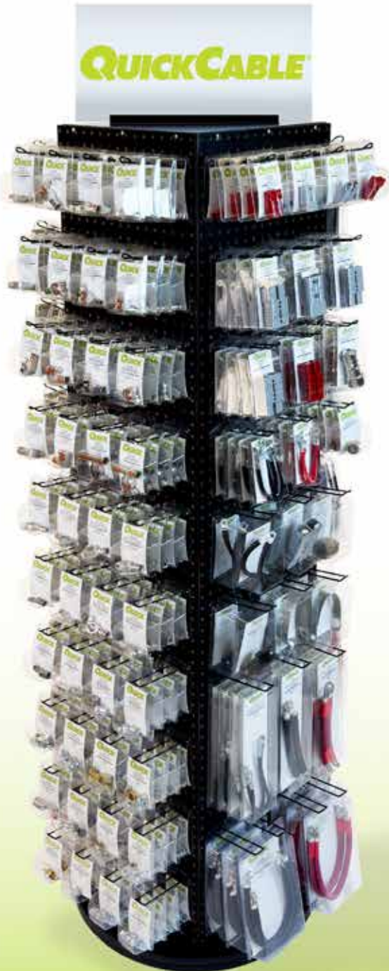
Panels A & B

Includes 109 part assortment, spinner, hooks, QuickCable sign, clamshells, inserts, plan-o-gram & assembly instructions