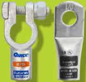
LUGS & TERMINALS

Providing a Variety of High Quality Products