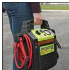
Easy to pack along and use.