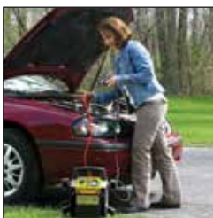
Starts any vehicle quickly with 55" long reach cables.