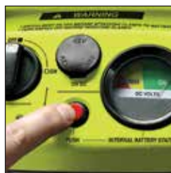
Internal battery status gauge.