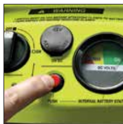
Internal battery status gauge.