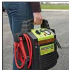
Easy to pack along and use.