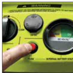
Internal battery status gauge.