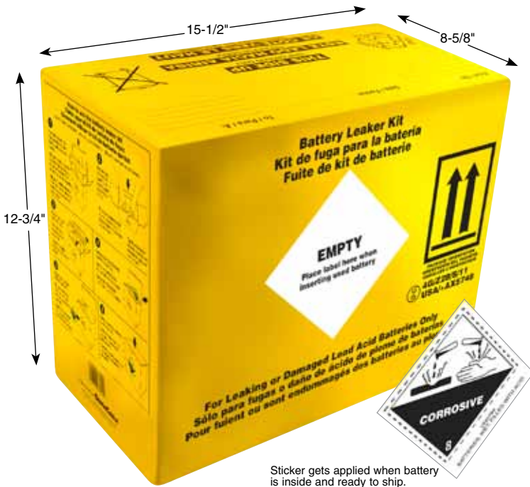
Sticker gets applied when battery is inside and ready to ship.

Designed for Shipping Damaged or Leaking Lead Acid Batteries